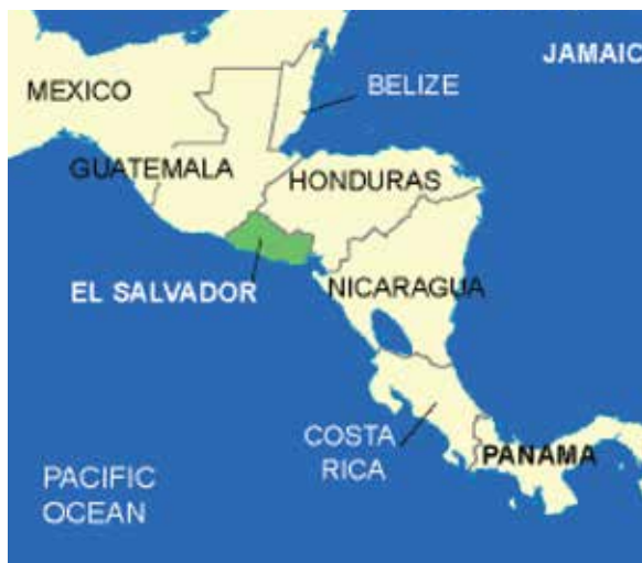
El Salvador, Central America

In El Salvador, Central America, we commemorate our dead in three special occasions: the anniversary of death, the Day of the Dead and, if we have lost our mother, on Mother's Day. The rituals are a mixture of Catholicism, animism and remains of the Aztec and Mayan traditions. On the anniversary, most people will ask that the name of the deceased be mentioned by the priest in the evening mass. However, more traditional families, mainly in poor communities, commemorate with "rezos" at home. These are gatherings to pray using two books of prayers of the Catholic church. A member of the community will lead the prayer and people will chant and sing. There will be an altar with the photo of the deceased, flowers and candles, and a glass of water for the spirit of the departed. Family and friends gather for prayers every day for nine days leading up to the anniversary. On the day itself, apart from the prayers, there are food and drinks - "tamales" and sweet bread, specially "semita", coffee and fizzy drinks, and occasionally, alcoholic drinks for the men. Most of the praying is done by the women and children, while men stay outside the house, on the "patio", eating, drinking and playing cards. The "Rezo" this day lasts the